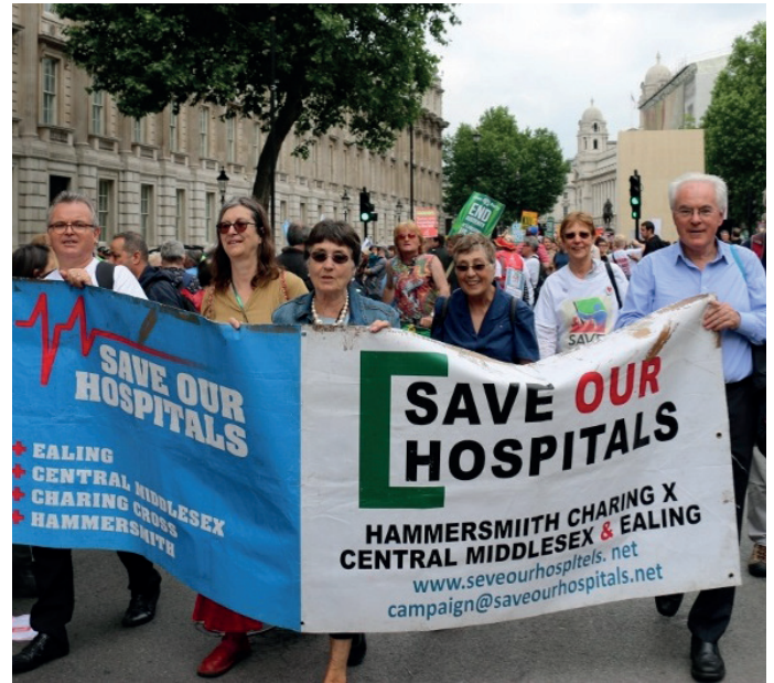
Local campaigns have been vital to defend threatened hospitals

NHS England claims that there would be a ‘principle of subsidiarity’, meaning that ‘place-based’ decisions would be taken “as close to local communities as possible”.