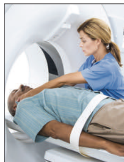
Rutherford/SFT link up

“The recent publication of one contract gives a glimpse of just how opaque and secretive these deals can be”