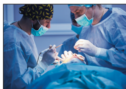
Elective surgery: doubt over when it will return