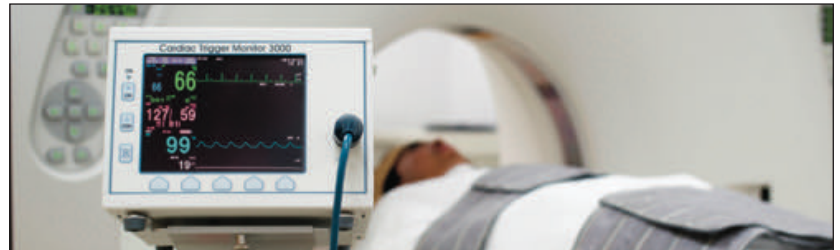
MRI procedures: back to normal levels by end of October?

Whether such ambitious targets can be achieved so quickly, given post-covid restrictions, continued staff shortages (with some key staff having been reassigned), and the complexity of managing (and staffing) capacity commissioned in private hospitals on separate sites, isn't considered by NHSE. It just sent out the orders.