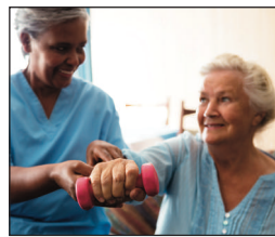
Community health: the basis of many contracts

This comes as no surprise, as in November 2016 it awarded Virgin Care a seven-year contract worth around £700m for provision of more than 200 community health services. This con-