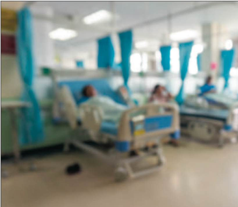
Hospital beds: lack of transparency over block-booking of private capacity

The latest available NHS England (NHSE) figures (dated 3 September) show that, of available beds open overnight, an undifferentiated 110,000 beds of all types – general, acute, mental health, maternity and learning difficulties – were occupied.